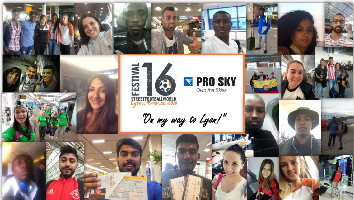
Young Leaders taking a selfie before flying to Lyon, France

No group is like the other: Despite Pro Sky’s experience in group flights, this project has created an opportunity for our team to gain new perspectives when organising air travels: 86 representatives of delegations from all over the world, put their trust in us. It was the first ever travelling experience for most of the young leaders, which made this specific project a very personal one.